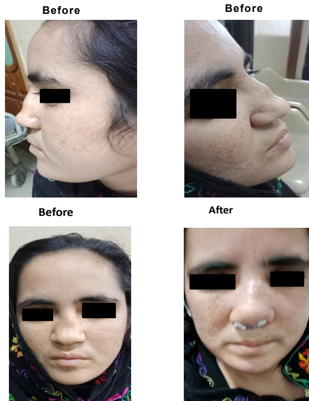
Fig 3. Pictures of a female patient representing the preoperative versus one-year post-operative results after the rhinoplasty procedure.