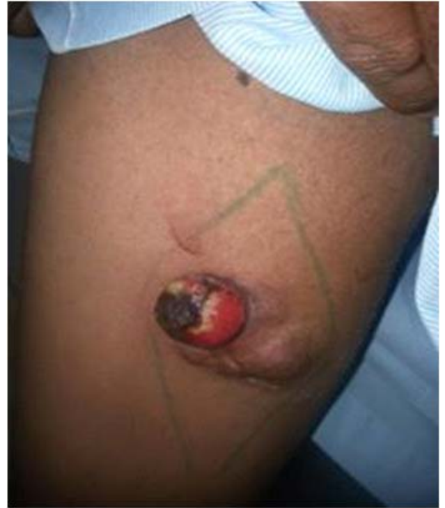
Fig 1. About 2.0x2.0 cm irregular erythematous-violaceous lesion showing an atrophic change with a scar tissue in the central portion on the medial region of the right thigh. An area in the Lesion shows a reddish brown in color

After initial assessment, the swelling underwent biopsy and it was diagnosed as dermatofibrosarcoma. After initial diagnosis, metastatic work up was conducted, including CT scan, chest, abdomen and pelvis revealed that it was negative for distinct metastasis. The case was presented in the tumour board and the recommendation of tumour board was surgical excision, Fig. 2. Patient underwent wide local surgical excision with 2 cm safety margin, performed under general anaesthesia and the specimen were sent to final histopathological assessment. The specimen contained deep fascia, and some part of the muscles. Finally, histopathological examination of resected specimen revealed characteristic cartwheel appearance confirming the diagnosis of the dermatofibrosarcoma protuberans (DFSP), Fig 3.