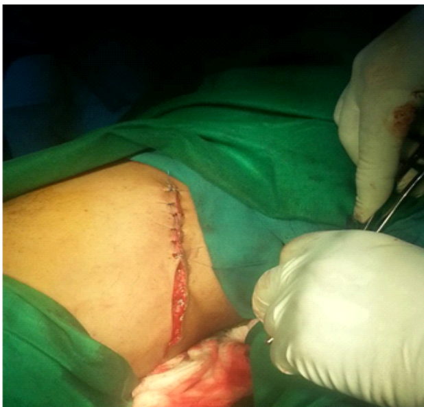
Fig. 2. Post-local wide excision and closure of the wound