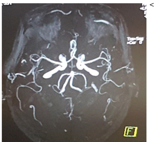
Fig 1. MRA showing the vessels of the circle of willis

N; number of participants, ACA; Anterior cerebral arteries, ACoMA; Anterior communicating artery, ICA; Internal carotid artery, PCoMA; Posterior communicating artery, PCA; Posterior cerebral artery, *p-value; <0.05 is considered significant