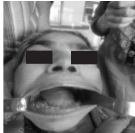
Fig C and D: Showing no dental problem i.e. no caries and periodontal problem.

down-regulatory cellular excitability 15 . This drug also helped our patient.