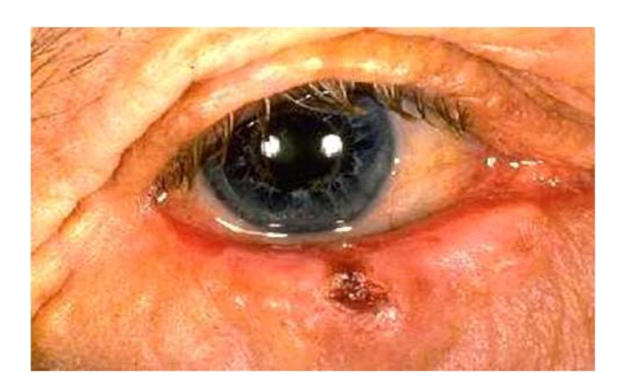
Fig. 1 Clinical presentation

thickening of lid. The lesion was excised and sent for histopathology. Based on history, clinical examination and histopathology slide. what is your diagnosis?